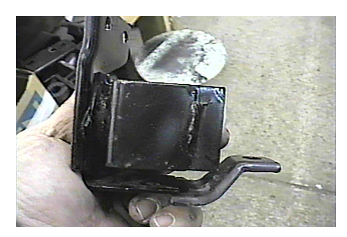
8. Remove anti vibration device one each side with 10mm and 12mm socket. This factory component will NOT be reinstalled.

7. With all the bolts and rivets removed, there are two tabs, one at the base of the turn signal opening and one on the inside of the headlight opening, release these tabs and pull the bumper forward and off. Before installing baseplate move temperature sensor located on the bottom side of the metal inner bumper (Refer to photo in step 6).