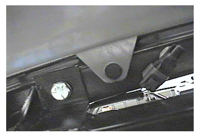
6. Remove two push pins located just under the metal bumper, one each side.

5. Unbolt the three 10mm bolts on the top side of grill.